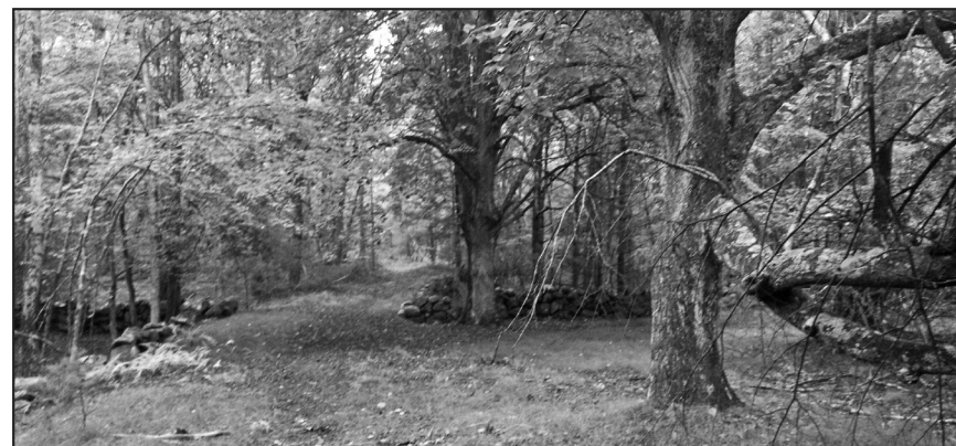
Jones Camp Trail

The pathway through the hill is, if anything, even more striking than the existing trail, and leads through a forest of white oak, hickory, and mature white pine with a blueberry and huckleberry understory, to the shores