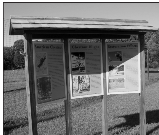
Informational kiosk at the Chestnut Orchard