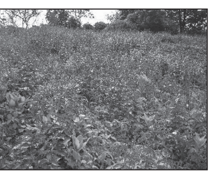
Black Swallowwort and other invasives before treatment.