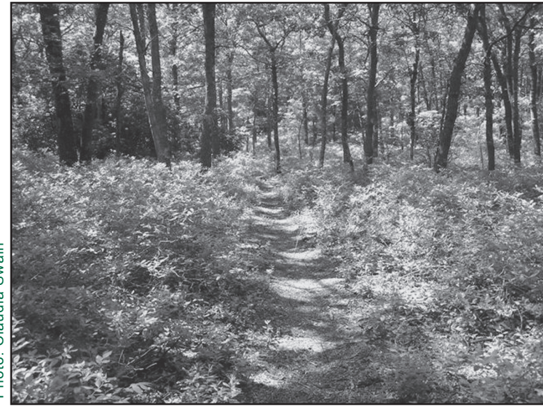
Along Polly's Loop Trail in Perryville.

The walk around the perimeter of Weeden Farm gives an idea of what much of the landscape was like a century and a half ago when farming was in its prime. These trails provide their visitors with silent readings in botany, forestry, geology, history, while also contributing to one's sense of health through exercise. They are constantly changing through the seasons and are equally interesting in the bareness of winter as during the leafy wealth of summer.