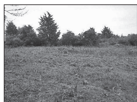
Forty-seven days after treatment.