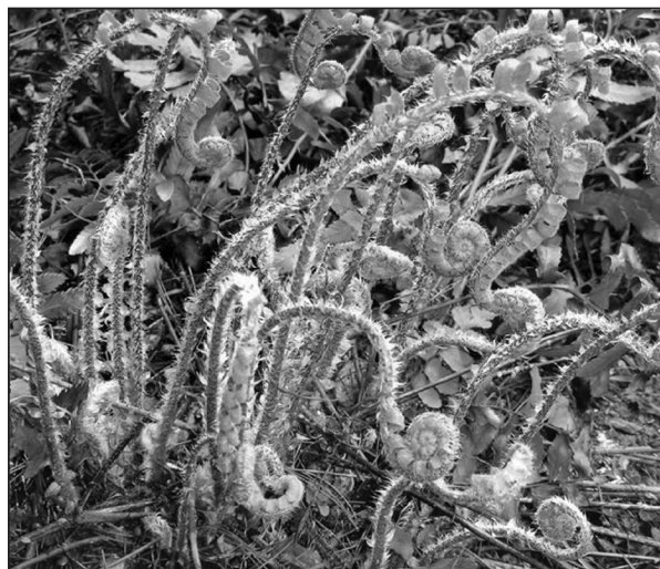
Fiddleheads in early spring 2010