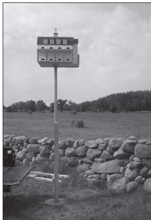
The site of the purple martin house at Weeden Farm will be the starting point of the new Jonnycake Trail.

The South Kingstown Land Trust will hold its 31st annual meeting at 2 pm on Sunday, April 13th at the Barn at 17 Matunuck Beach Road. After a short business meeting, the new Jonnycake Trail will be unveiled and dedicated. The trail will start at the Barn and weave its way to the Grist Mill pond just east of Moonstone Beach Road. As that pond is a winter haven for a variety of ducks, we hope to have a viewing platform in place in the near future. After the meeting and dedication, refreshments and beverages will be served. Please RSVP to jane.baumann@sklt.org . Weather permitting, after the meeting, we will hike the first phase of the new trail.