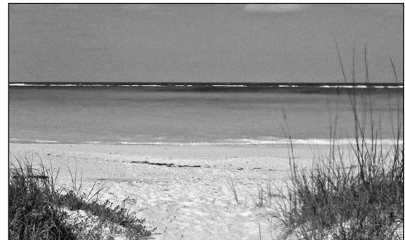
Auction item: One week for four in paradise on Eleuthera, Bahamas!