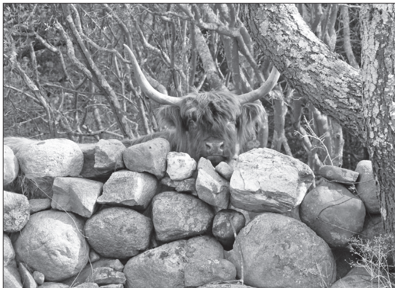
You never know what you'll find on our properties!