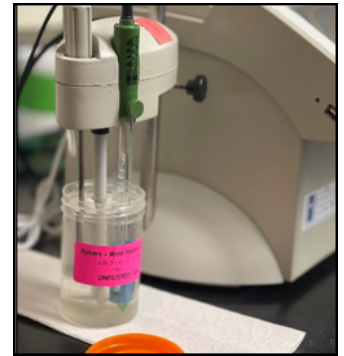
The Hanna Meter at URI Watershed Watch, used to measure pH